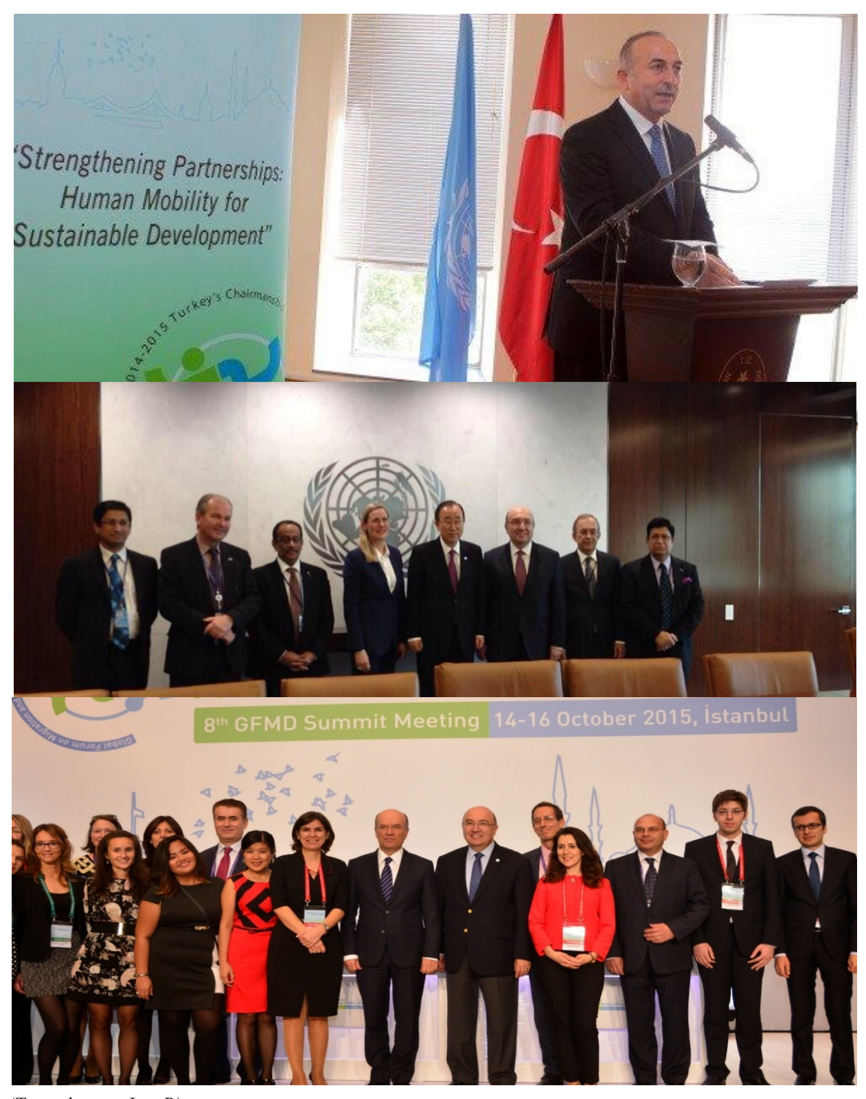
(Top to bottom, L to R)