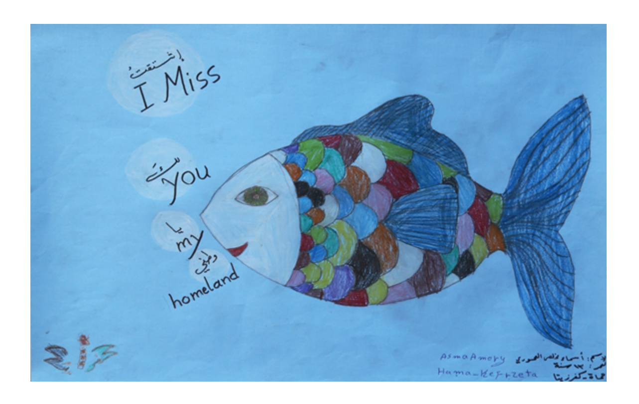
A photo drawn by a Syrian child.

unlock the benefits of migration and human mobility for the sustainable development of all.